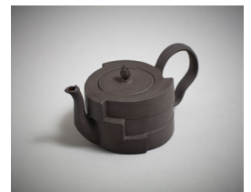
Single Dwight with cone, 2017

Thrown and altered brown stone-ware with press moulded additions 180mm (H) x 300mm (L) x 110mm (D) $3,800