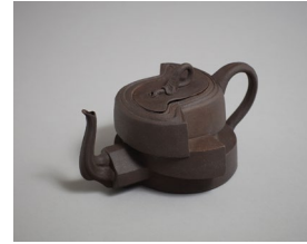
Engine Two with Snail Teapot, 2017

Thrown and altered brown stone-ware with press moulded additions 150mm (H) x 250mm (L) x 180mm (D) $3,800