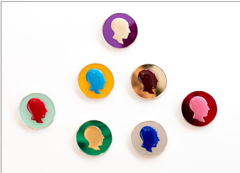
Len Lye Cameos $2,000 each – from a 2017 edition of 10 Len cameos commissioned by the Govett-Brewster Art Gallery Foundation. These are all unique colour combination works. Sales benefit the Govett-Brewster.