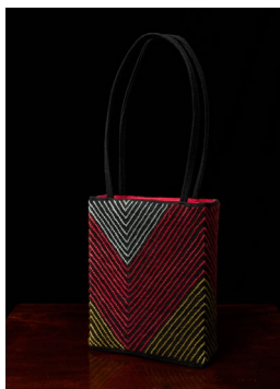
Bande Bag, 2015 Linen, wool $1,250