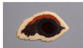
Slo, 2017 (Sloth)