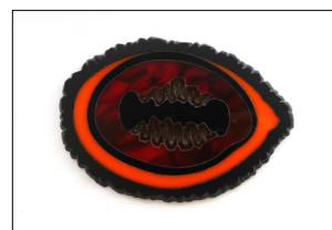
Drom, 2018 (One hump Arabian Camel)