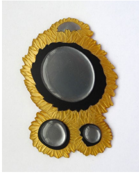
Chnid, 2018 (Wolf Spider) NB this one 1/3 is sold.