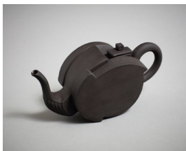
Cam Rocker, 2017 Thrown and altered black stone- ware with press moulded additions 130mm (H) x 250mm (L) x 80mm (D) $3,800