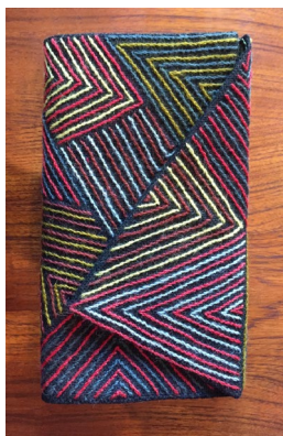
Deflection clutch, 2018 Linen, wool, silk $1,450