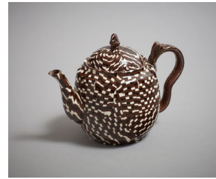
Brown Betty with acorn, 2017 Agateware $2,400