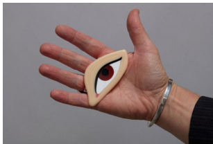
Mosapien, 2017 (the artist's own eye)