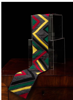
Diagonal Scarf, 2015 Linen, wool, silk $550