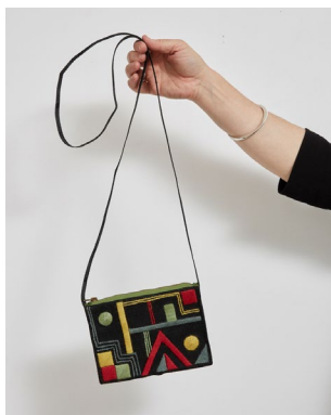
Bloc Bag, 2017 $550