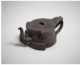
Double Dwight with flower, 2017 Thrown and altered black stone- ware with press moulded additions 100mm (H) x 200mm (L) x 125mm (D) $3,400