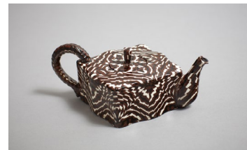
Ladies' Teapot, 2017 Agateware $1,800