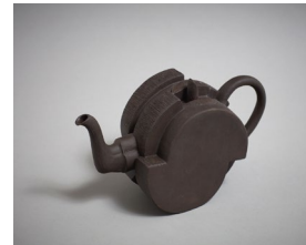
Revolutions Teapot, 2017

Thrown and altered brown stone-ware with press moulded additions 150mm (H) x 250mm (L) x 180mm (D) $3,800