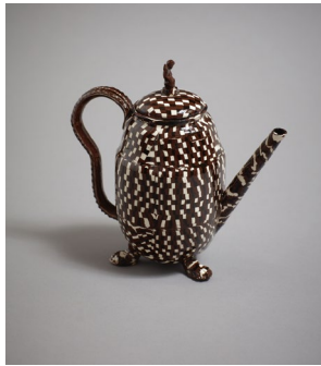
Caffeine on feet, 2017 Agateware $2,800